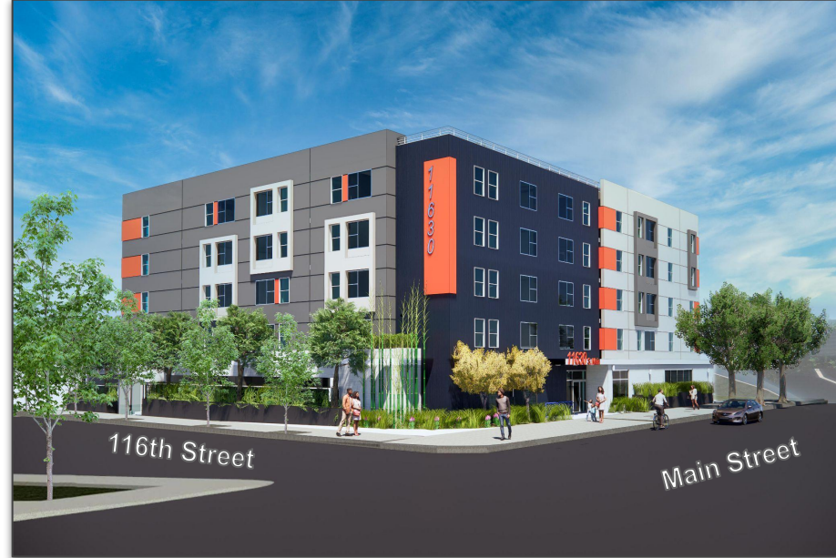
AFTER: New building 84 UNITS (71 1BR, 9 2BR, 4 3BR)

Attractive facade with enhanced materials and lush landscape creates a safe and pleasant pedestrian experience