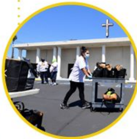
Weekly food drive at 88th Street Church of God

Partner with faith-based organizations, academic institutions, and local government to deliver projects that meet community needs