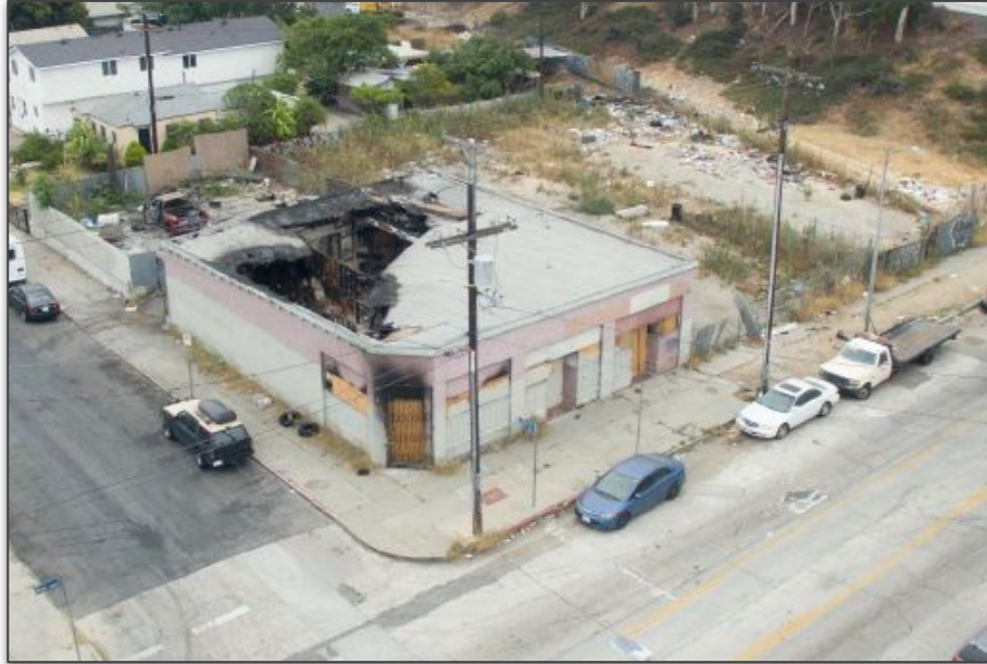
BEFORE: Vacant/used car parking