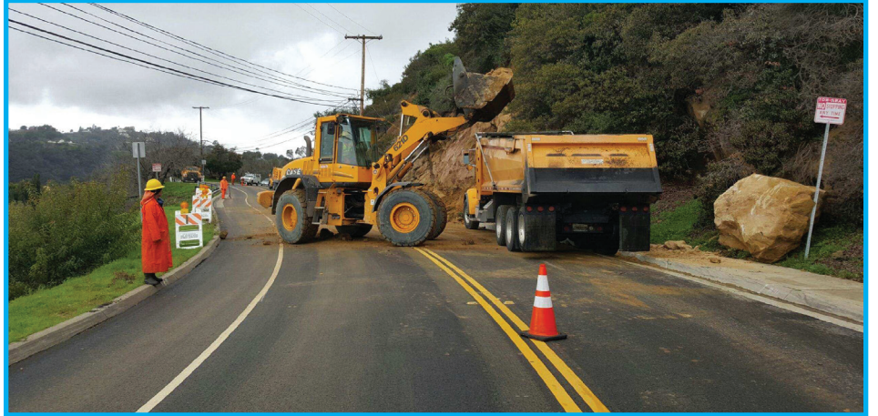
Bureau of Street Services crew responds to one of many mudslides that occured during the winter storms.

The Department of Public Works, in conjunction with the Mayor and City Council Offices, the Emergency Management Department and multiple City agencies, responded to various wet-weather related issues during January and February, when a series of significant winter storms hit Southern California.