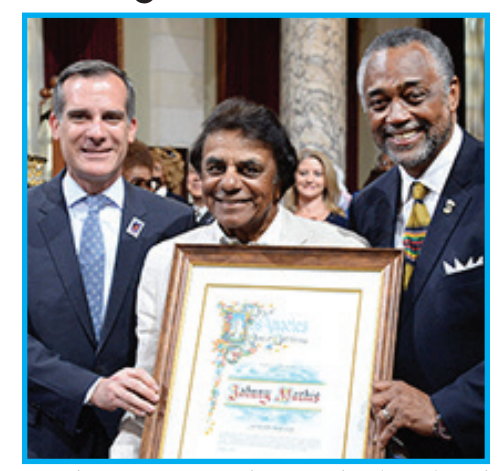
Legendary entertainer Johnny Mathis (center) with Mayor Eric Garcetti and Councilmember Curren Price.

The City of Los Angeles kicked off a series of celebrations for African-American Heritage Month with a ceremony at City Hall on February 1.